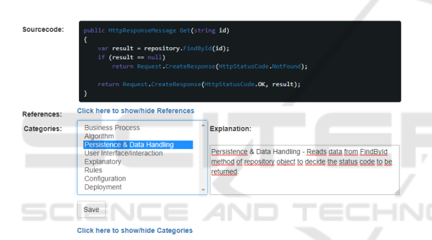
Figure 2: Crowd worker view.

the list of possible categories. The crowdworker view additionally contains a list of source code references, allowing the crowdworker to review also the source code of pieces of source code which are referenced. Basic authentication of crowd workers is achieved through user-specific urls and temporary tokens.